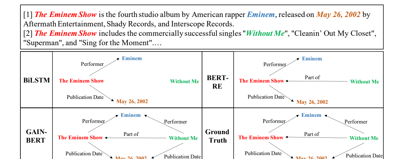
Figure 3: The case study of our proposed GAIN and baseline models. The models take the document as input and predict relations among different entities in different colors. We only show a part of entities within the documents and the according sentences due to the space limitation.

Jia et al., 2019) leverage dependency graph to better capture document-specific features, but they ignore ubiquitous relational inference in document. Recently, many models are proposed to address this problem. Tang et al. (2020) proposed a hierarchical inference network by considering information from entity-level, sentence-level, and documentlevel. However, it conducts relational inference implicitly based on a hierarchical network while we adopt the path reasoning mechanism, which is a more explicit way.